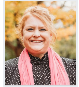
Denise Lyons Commissioner/ State Librarian Kentucky Department for Libraries and Archives